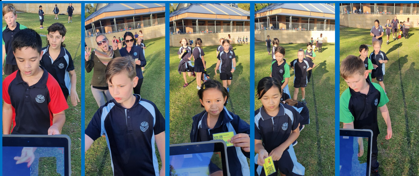
Students using the new scan a lap process at yesterday's Run Club.