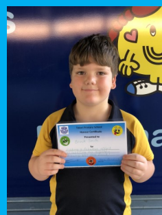
Photo of the absentee from the previous fortnight presentation.