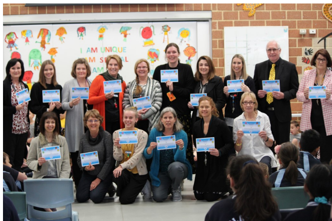
Staff receiving their World Educators' Day Honour Certificates

Congratulations also to the P&C on their role in coordinating a hugely successful Halloween Fete last Saturday. The P&C combined with the Balcatta Buzz group to provide fun, food and entertainment to the local community. Thousands of people, of all ages, dressed in Halloween costume to create a family friendly community event. There were food trucks, a petting zoo, bouncy castle, live music and even a wicked witch in the nature play fort giving out lollies. Feedback on the event has been very positive. A lot of parents gave up a lot of their time to ensure the event's success. Thank you to everyone who supported the Halloween Fete.