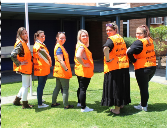
Parents (and a former student) showing off their very fashionable fluoro duty vests

PRINCIPAL'S MESSAGE: Thank you to the wonderful P&C for organising a special treat for staff on last week's World Educators' Day. The P&C continued the tradition of acknowledging the Takari PS staff by providing plates of scrumptious food and assisting with recess duty so staff could sit back and enjoy a special morning tea in peace and quiet. Students from Year 5 also presented Honour Certificates to staff at the Pre-primary assembly earlier in the morning. The staff are very appreciative of the P&C and parents' support. Thank you!