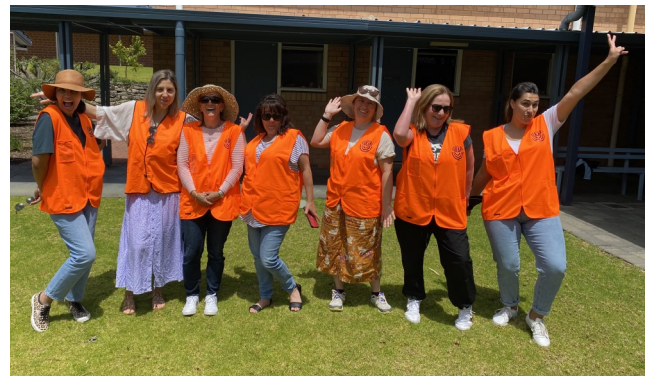
Parents showing off their very fashionable fluoro duty vests.

PARENT SURVEY: Thank you to all the parents who completed the survey. The data will be collated and used in future planning for the school. A summary of results will also be provided to the School Council and parents very soon.