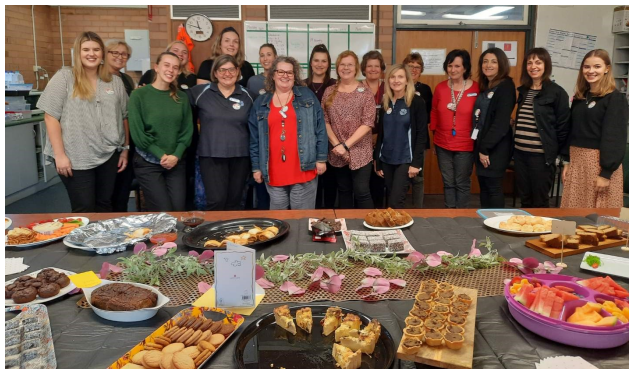
The delicious lunch time spread.